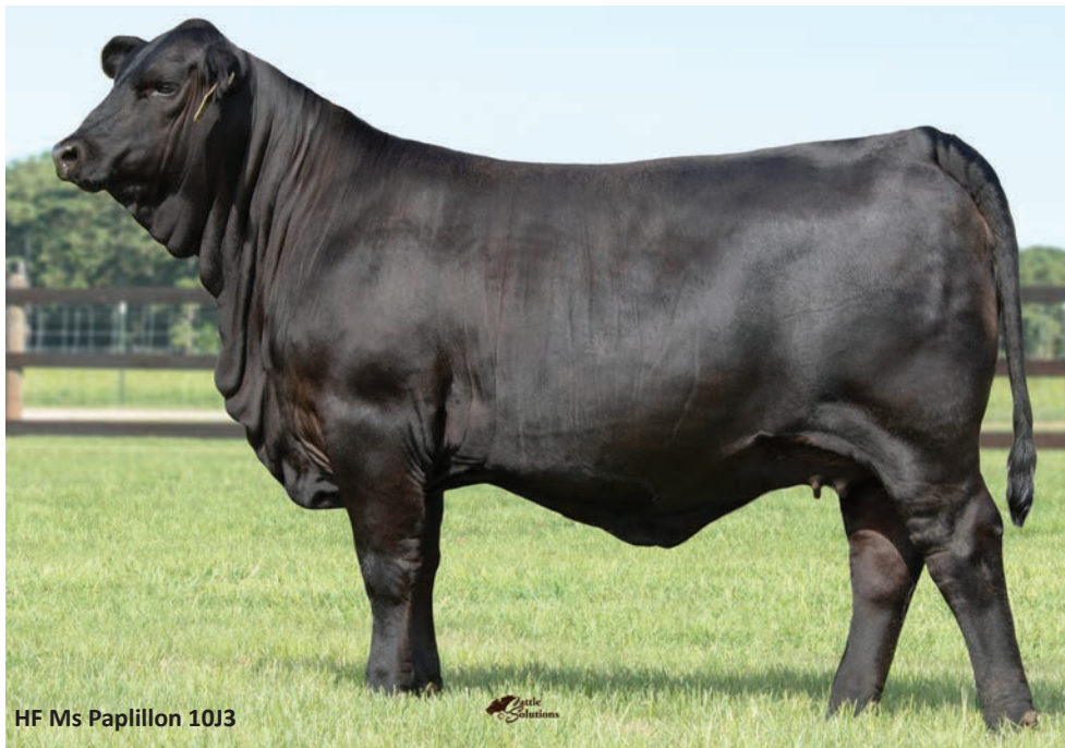
HF Ms Papillon 10J3