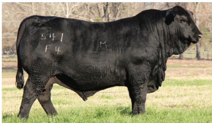
MC Ms Boom Town 541F4