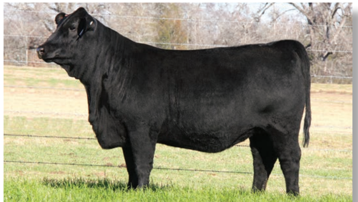
MC Ms Prime Plus 468L8

This is a "first come, first serve" sale where any buyer can take from four (4) straws up to forty (40) straws depending on availability and number of straws previously sold at the time of contact. Once this allotment is spoken for semen sales for MC A Plus 468J20 will close for the remainder of this spring and summer.