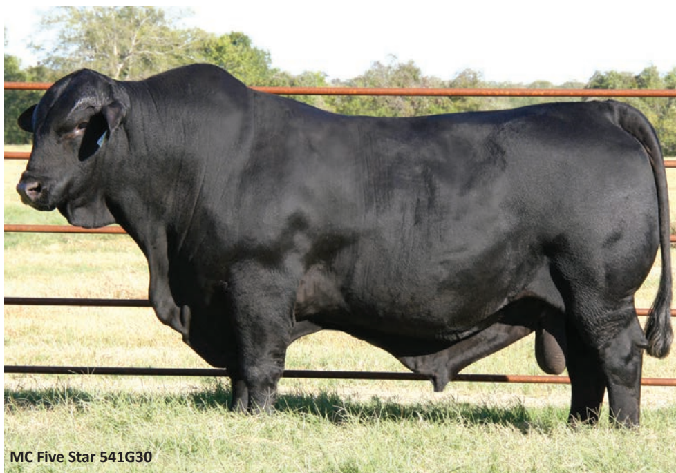
MC Five Star 541G30