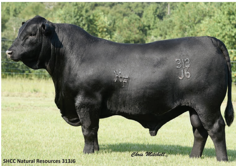
SHCC Natural Resources 313J6