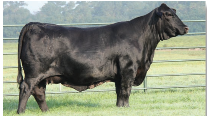
RBM Ms Special Forces 313A

These are priced at $750 per embryo. They are IVF embryos, and each is a Grade 1.