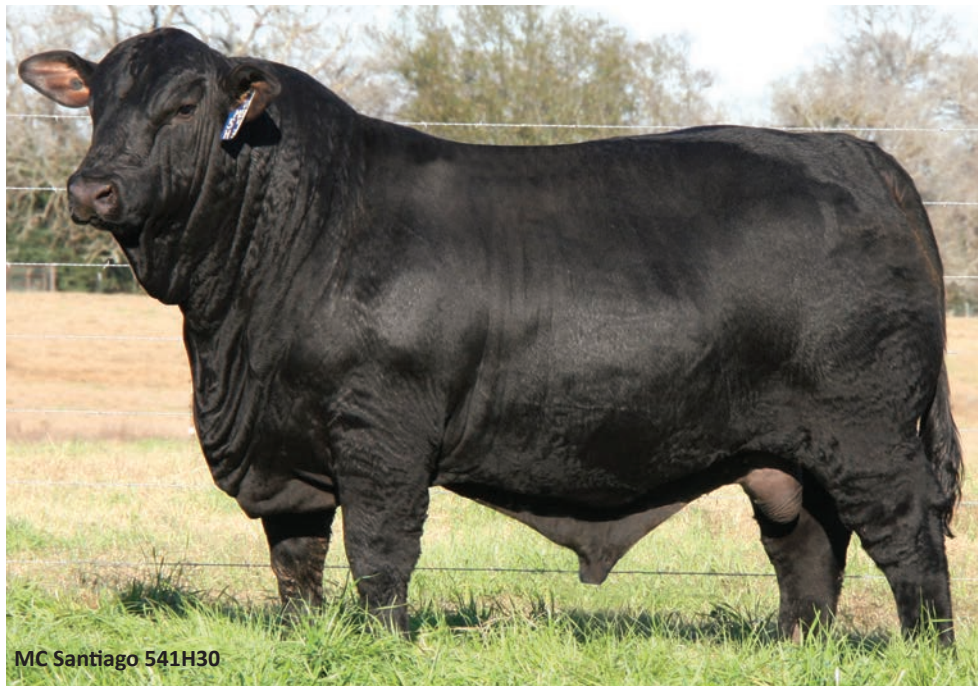
MC Santiago 541H30