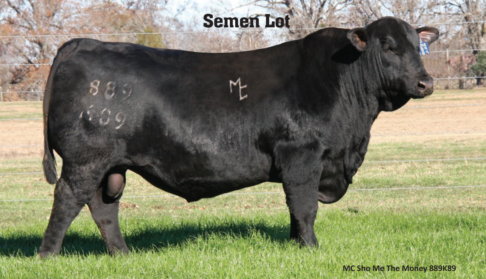
MC Sho Me The Money 889K89