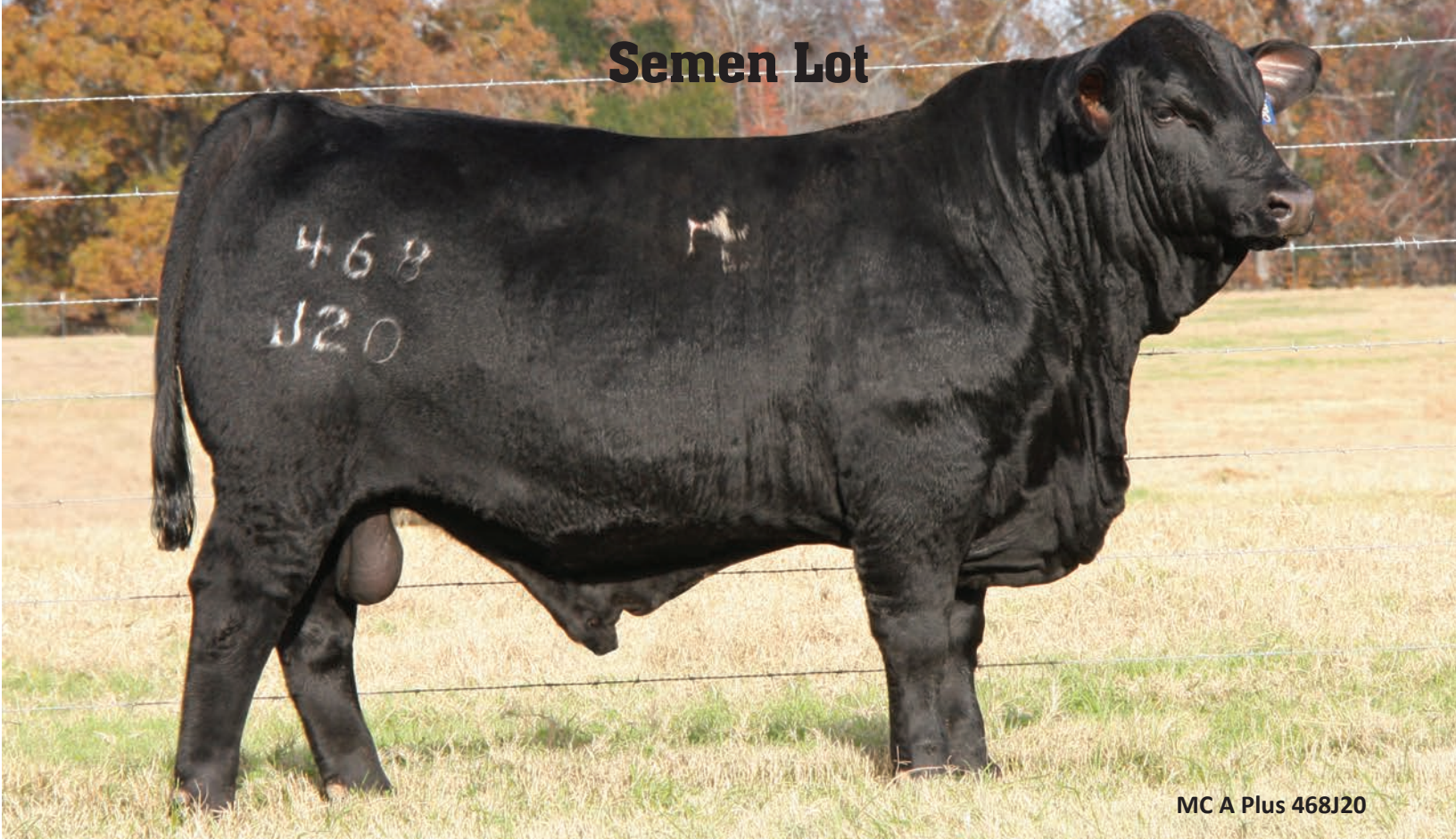
MC A Plus 468J20